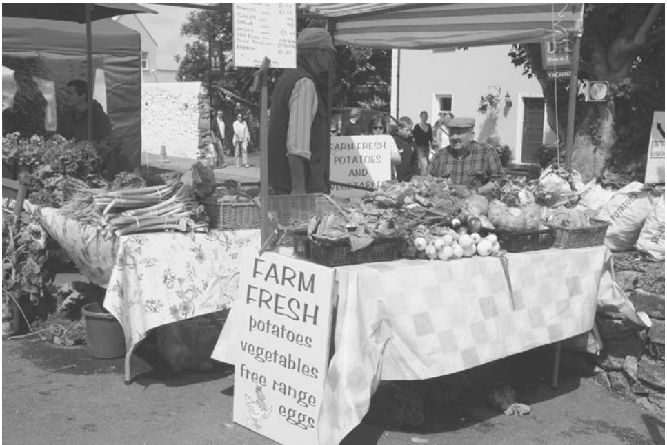
Fresh produce market in Ballvaughn, Ireland.

Street traders have been selling food in Irish cities for hundreds of years. Some of these from the 18th century have been captured in a series of drawings called Dublin Cries by the artist Hugh Douglas Hamilton. Food sold included oysters, fresh milk, apples, fish, hot peas, and herbs. The quintessential Dublin anthem “Molly Malone” is about a fishmonger who sold “cockles and mussels alive, alive oh.” Nowadays